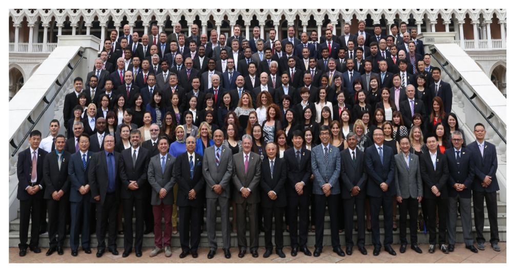
Globelink Group Annual Conference 2014 commemorative photo (Macao)

The annual conference is one of the two big events that are held annually, the other is the CEO's Summit that is happening in Singapore. Annual conference is usually held at difference locations around the globe to which Globelink Group office is present. On 2013, the event was graced in Barcelona, Spain.