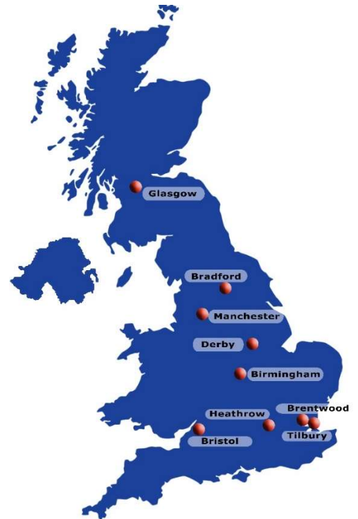
Depot locations across the UK

One of our main strengths is the speed and accuracy of the shipping documents we produce for each shipment, which in turn enables our clients to pass the same high quality service to their UK exporters and overseas agents.