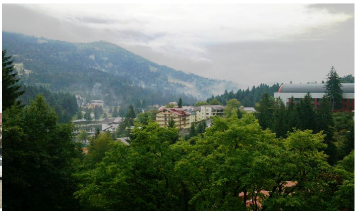
Poiana Braşov Summit - 1,805.88 ft