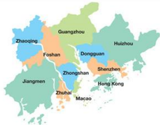
Pearl River Delta Region

For more information and enquiries, please contact Globelink Hong Kong: